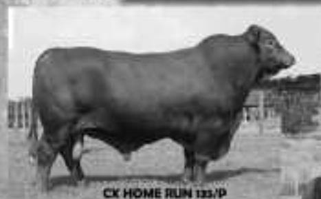
CX HOME RUN 135/P

DVAuction Bidding every Real Time Auction Fast and easy. Every listing available. www.dvauction.com