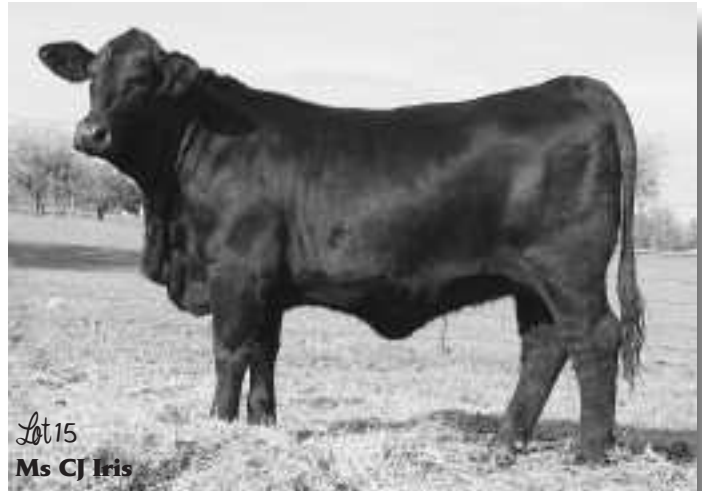
Lot 15 Ms CJ Iris

EPDs: BW: -1.6 WW: 22 YW: 47 Milk: 10 TM: 21 SC: 0.70 REA: 0.31 IMF: 0.01 FT: -0.004 Performance: BW: 74 (*) WW: 623 (*) YW: 989 (*)