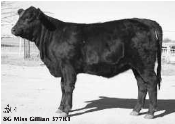
Lot 4 8G Miss Gillian 377R1