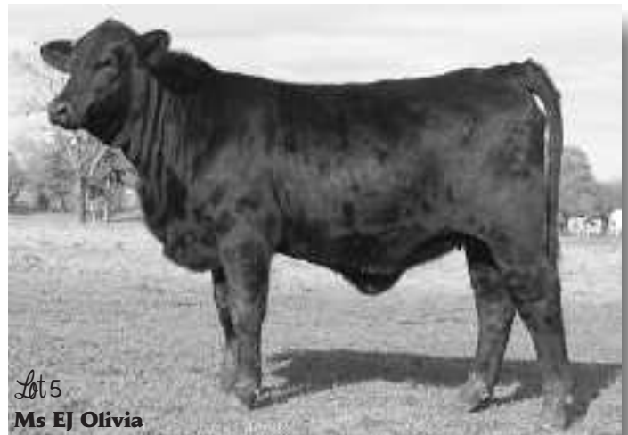
Lot 5 Ms EJ Olivia

Best Bet of Brinks 535H38 Ms Brinks Ali 789M Brinks Sleep Easy 95N Ms Farris Transformer 570L Backside of Brinks 14K5 Clem's Pepper 937G TVR Monopoly 135D4 SJR Ms Coalline 500E3