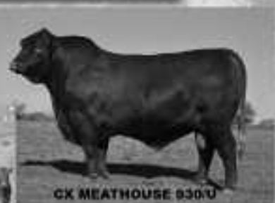
CX MEATHOUSE 930/U

DVAuction Bidding every Real Time Auction Fast and easy. Every listing available. www.dvauction.com